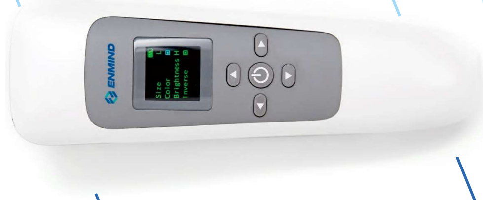
Vein Viewer VV-100

Shenzhen Enmind Technology Co., Ltd. Add: Room 201, Block A, No.1, Qianhai Road 1, Qianhaishen Port Cooperative District, Shenzhen, 518000, P.R. China. Tel: +86(0755) 2331 6007 E-Mail: sales@enmind-tech.com